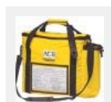
ACR 2273 Ditch/Abandon Ship Bag

The contents of your ditch bag will have a lot to do with where and what climate you're cruising in, but there are some critical items that are universal in their place in your emergency stores. They are divided into two categories: "Rescue" and "Survival" items. We recommend you carry some version of all of these in your bag.