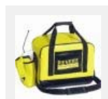
Revere 80 Ditch/Abandon Ship Bag

If you've been boating for any time at all, you've heard the warning "Don't forget to have an up-to-date ditch bag onboard!" over and over ... and now let me say it again: before fancy toys and other expensive onboard luxuries, a ditch bag (also called an "Abandon Ship Bag") is critical.